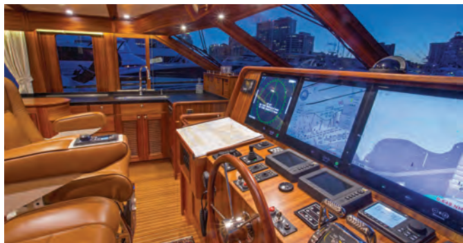
Plenty of display space welcomes a hands-on owner-operator to the helm.

have and they go out in the roughest conditions. It's by the same designers, with the same hull form; it just weighs a hell of a lot more [130,000 pounds fully loaded]."