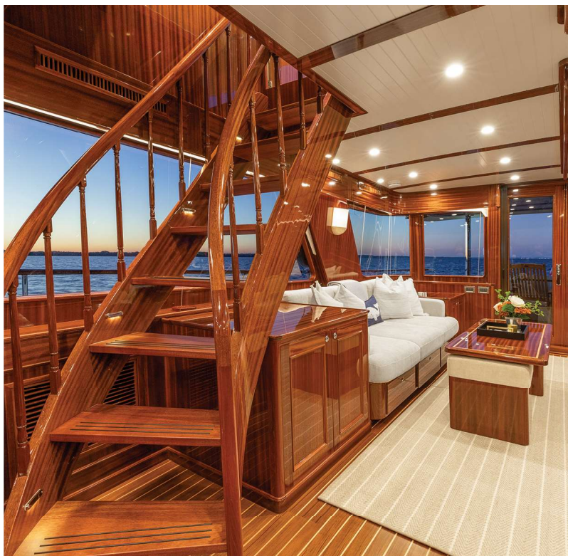
Left: Double glass doors open to the interior air-conditioned salon, where a winding staircase leads up to the flybridge (right).

The galley up saves on time and keeps the chef part of the social action. Although smaller than a full galley below, there are under-counter refrigerators, a Wolf three-burner cooktop, and a double stainless steel sink set in an L-shaped counter. Because this owner decided on the galley-up design, they turned the extra room below into a pantry where a washer/dryer could be installed or, in this case, a full-size fridge.